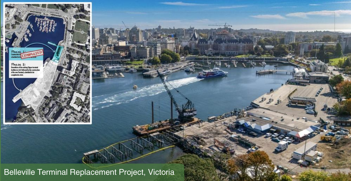
Belleville Terminal Replacement Project, Victoria