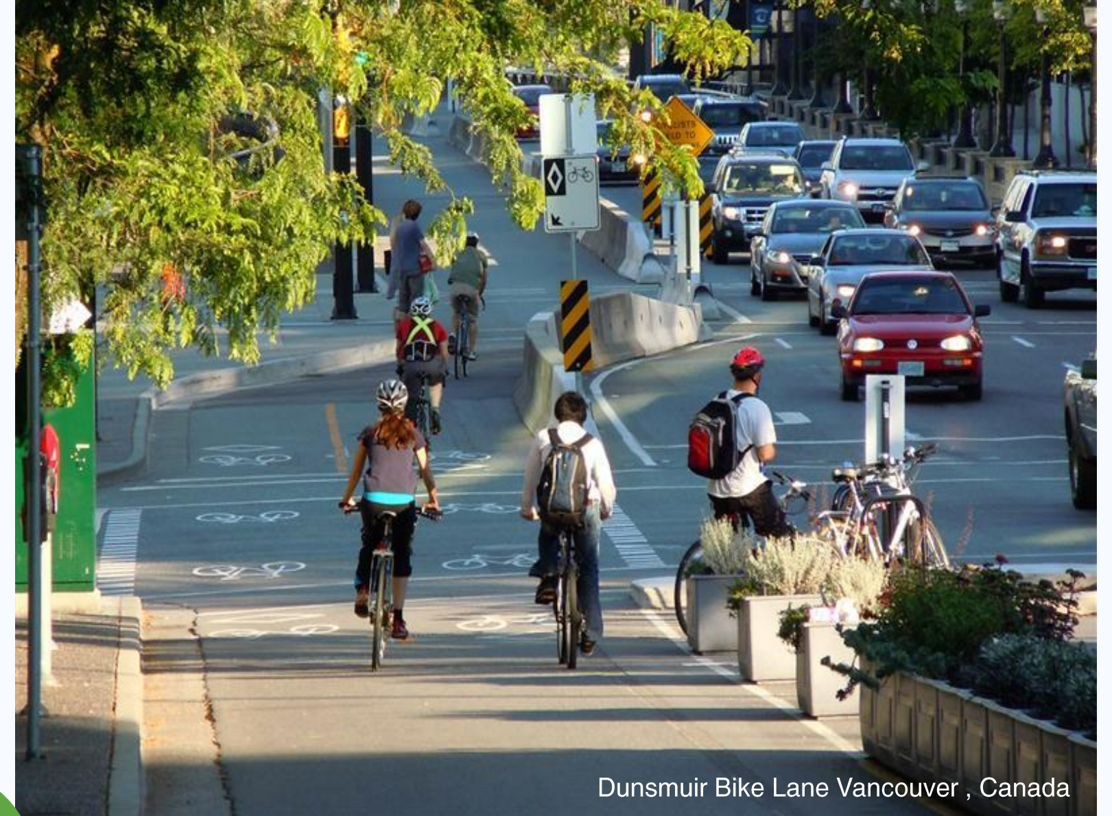
Dunsmuir Bike Lane Vancouver , Canada