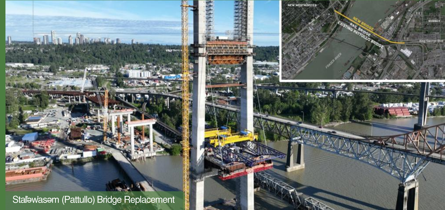
Ståfwasem (Pattullo) Bridge Replacement