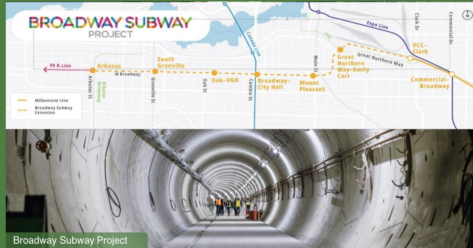
Broadway Subway Project

As Vancouver hosts the World Road Congress in 2027, large-scale projects such as the Pattullo Bridge Replacement and the Fraser River Tunnel Project are expected to be under active construction, offering delegates a real-time look at complex, multimodal infrastructure delivery.