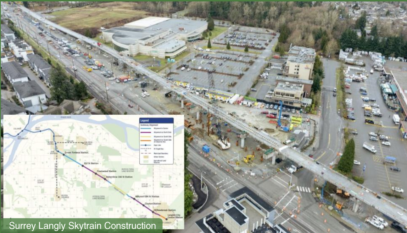
Surrey Langley Skytrain Construction