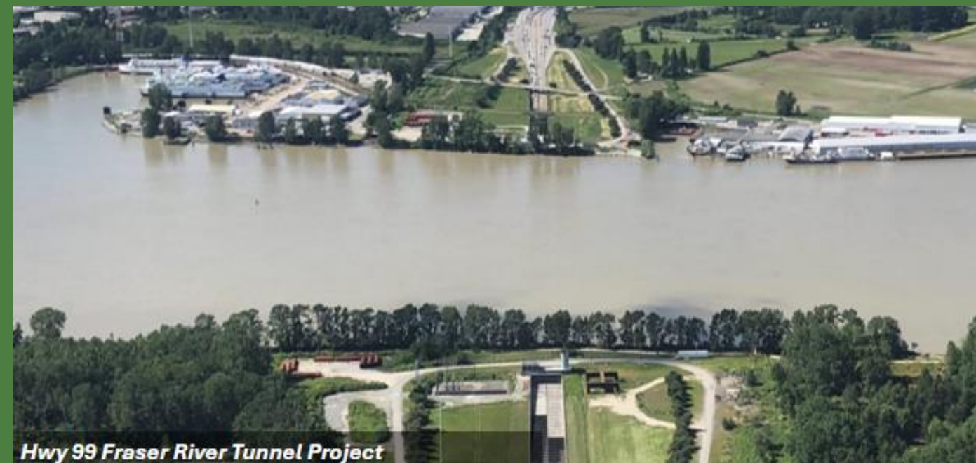
Hwy 99 Fraser River Tunnel Project