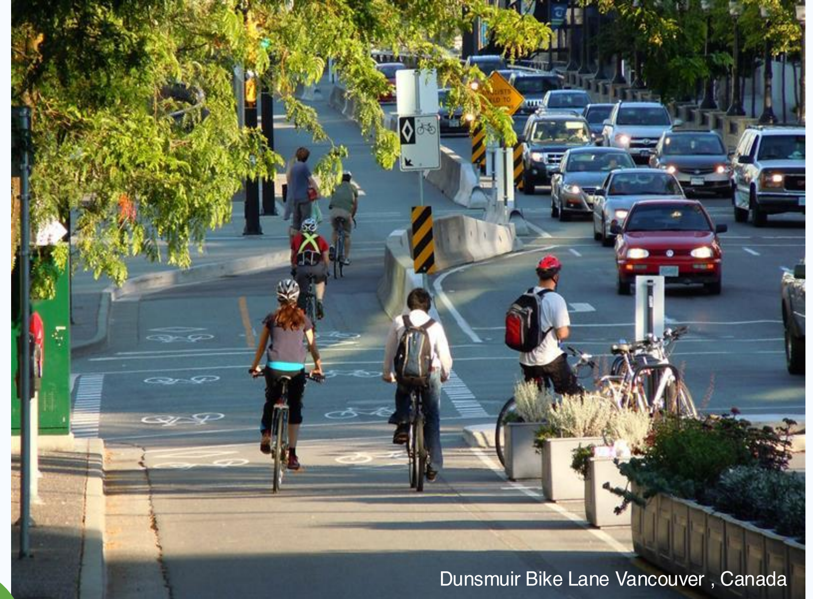
Dunsmuir Bike Lane Vancouver , Canada