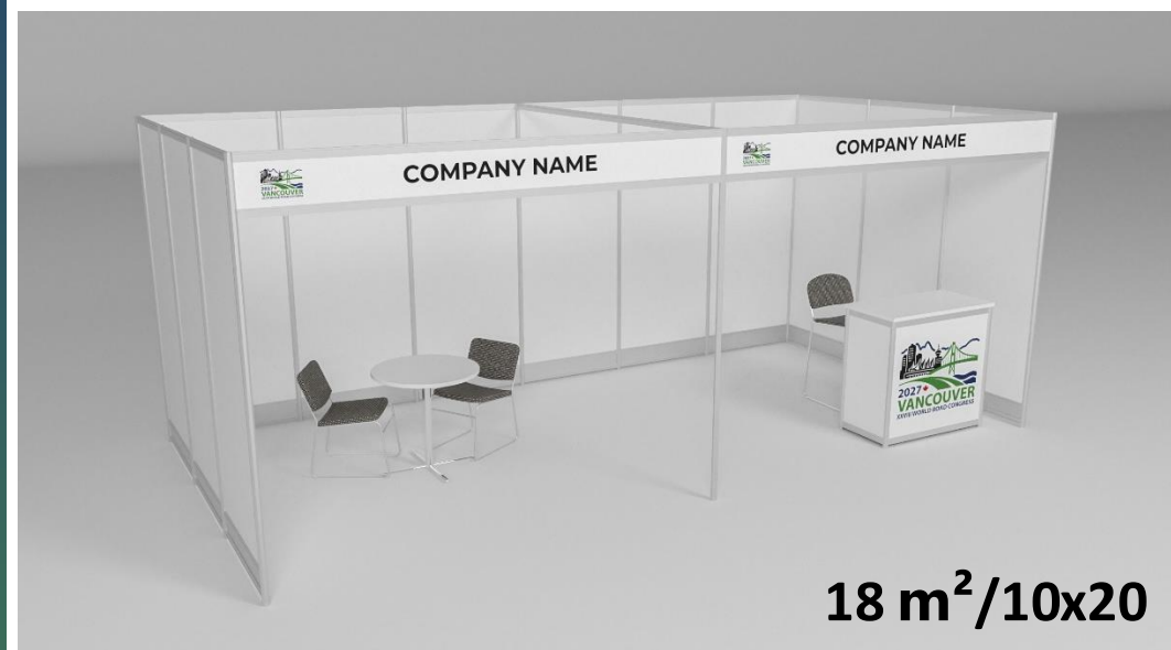
18 m 2 /10x20