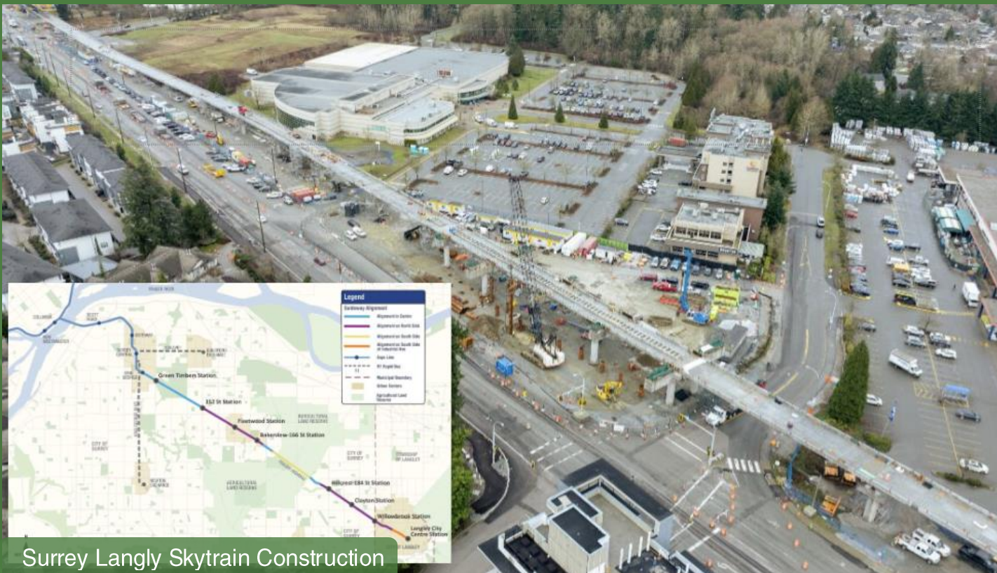
Surrey Langley Skytrain Construction