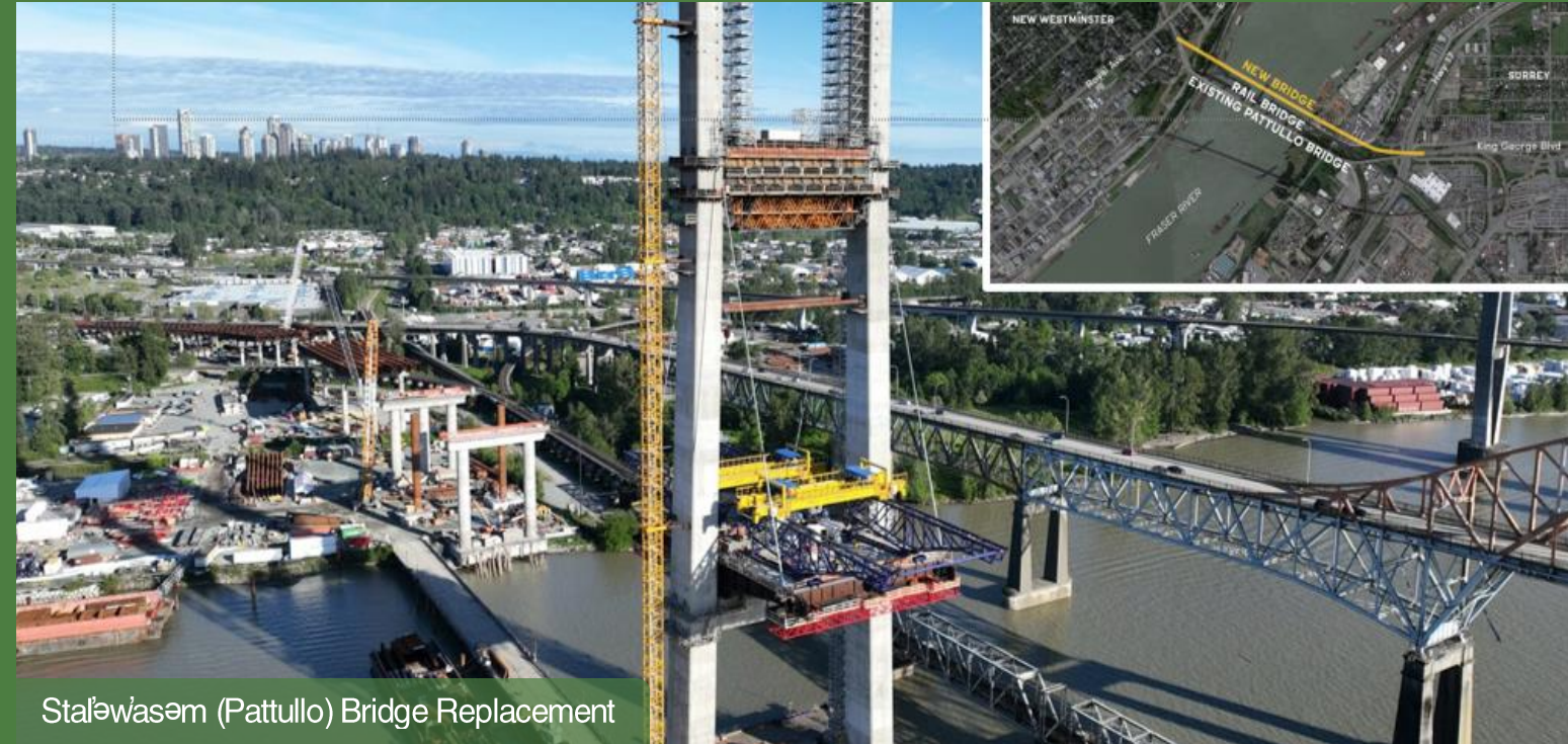
Stawwassen (Pattullo) Bridge Replacement