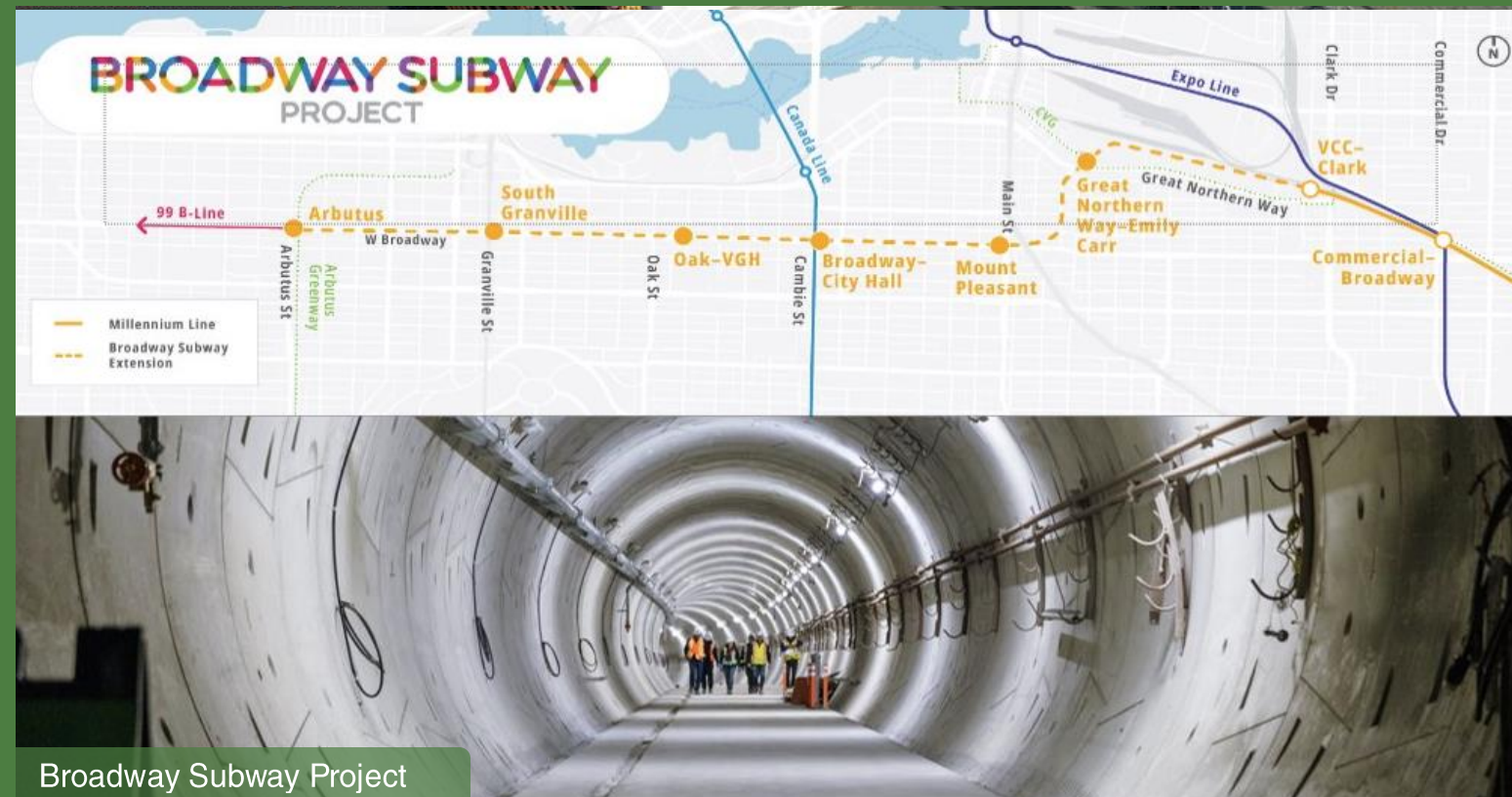
Broadway Subway Project

As Vancouver hosts the WRC 2027, large-scale projects such as the Pattullo Bridge Replacement and the Fraser River Tunnel Project are expected to be under active construction, offering delegates a real-time look at complex, multimodal infrastructure delivery.