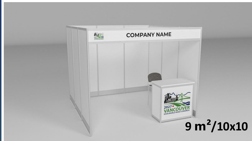
9 m 2 /10x10